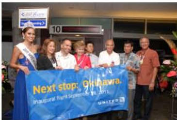
Inaugural flight to Okinawa Sep 2011.