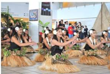
Inetnon Gef Pago dancers entertain passengers and tenants.