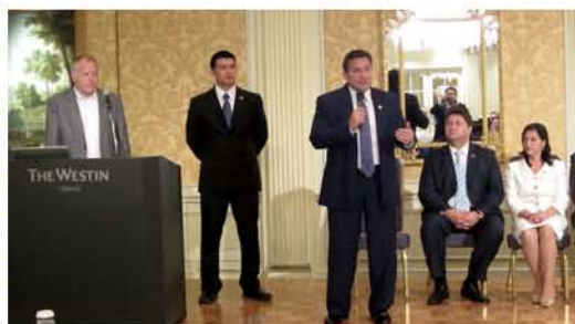
Governor Calvo leads Japan Trade Mission in Tokyo. September 2011.

business and it has the stability of the US flag.