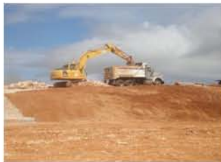
27 projects were completed in Fiscal Year 2010.

In November 2011, the US Department of Commerce ranked Guam as the 8th top US port for foreign arrivals. Japanese and Korean visitors make up most arrivals, Taiwan a distant third. Effective February 15, 2012, Russians are allowed to travel visa free under the Guam-CNMI visa waiver program, and Guam continues to pursue authority for Chinese tourists.