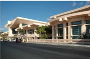
The A.B. Won Pat International Airport Terminal is the work location of over 2400 employees.

The first thoughts of an Airport are passengers, airlines, the terminal facility and all the activity that occurs from the curb to the cabin. However, there are many entities that make up the airport environment that do not come first to mind. Who are these players? United, Delta Air Lines, China Air, EVA Air, Korean Air, Jin Air, Philippine Airlines, Cape Air and Freedom Air, two major cargo operators, FedEx and