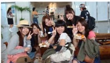
Tourists Enjoy Fiesta Plates during Chamorro Month 2011 celebrations.