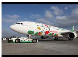
All EVA Airways flights from Taipei to Guam are now flying on Hello Kitty jets since January 3, 2012.

Terminal operations are supported by infrastructure and facilities that constantly need enhancement to meet the needs of the future.